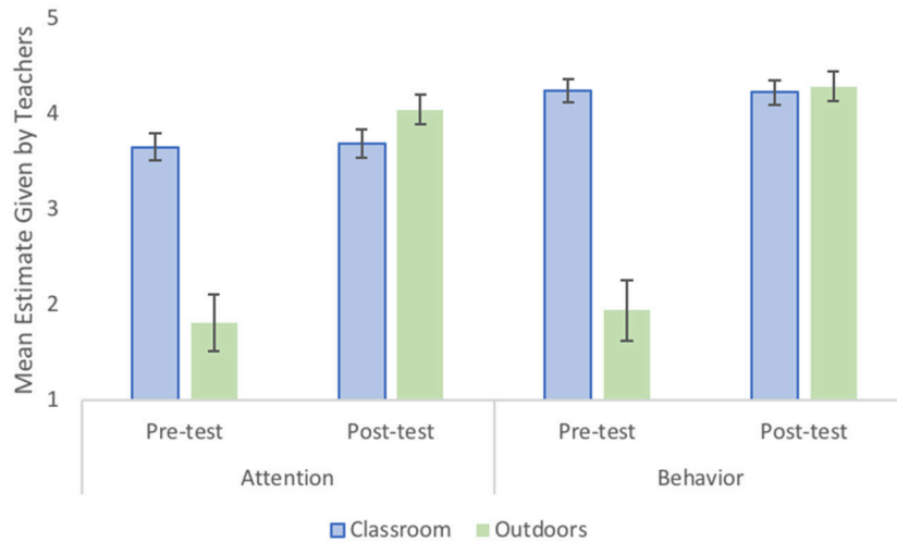
FIGURE 1 | Classroom and outdoor attention behavior among the treatment group. Teachers provided estimates of attention span and behavior levels from short (1) to long (5) and poor (1) to excellent (5), respectively. Error bars represent standard error. Paired t -tests indicate that differences between the teacher-reported pre- and post-test scores for attention and behavior while outdoors were significant (attention: t = -5.70, p = 0.000 ; behavior: t = -5.50, p = 0.000 ) as well as differences between the post-test scores in the classroom vs. outdoor settings (attention: t = -5.23, p = 0.000 ; behavior: t = -2.95, p = 0.003 ).