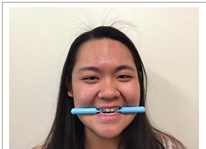
FIGURE 4 | The example photograph of the Smile Stick that was shown to all participants (written informed consent was obtained from this individual for the publication of this image).

hold (them/the device) in your mouth tightly. Make sure that your teeth are showing at all times. Be sure to mimic the facial actions exactly as they are shown in the picture.” For the device-free smile manipulation, participants were shown a photograph of someone displaying a Duchenne smile (see Figure 5 ). Participants received the following instructions: “For this final task, please smile naturally like the person in the picture. Please smile as big as you can and as sincerely as possible.” During the training periods for each manipulation, research assistants ensured that the participant’s teeth were showing and that their eye and cheek muscles were activated. Participants were corrected during the training period as necessary, but were not corrected during the 1 min data collection periods. Participants held each expression for 1 min while EMG was continuously assessed. After each manipulation, participants completed self-report measures of comfort, difficulty, and muscle fatigue and how positive, negative, and aroused they felt. Participants then moved on immediately to the training for the next manipulation. After all three manipulations were finished, participants were debriefed about the study.